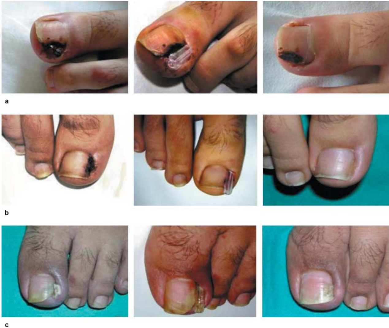
fig. 4 Samples of ingrown nails treated with the splinting method. (a) A 21-year-old, female medical student, who had been suffering from ingrown toenail for a year. Nail avulsion and other treatment modalities such as silver nitrate applications had not resolved the problem. (b) A 17-year-old student with a recurrent ingrown nail problem. (c) This 45-year-old man was the husband of a nurse; he had tried nail avulsion two times before this treatment.

a flexible tube in a similar way to us, but they did not anaesthetize the area, except in cases of severe, painful lesions, and patients with granulation tissue. Pottie et al. 32 treated ingrowing nail using cotton wicks in the nail sulcus. Although the materials used in the nail splinting technique differed, the principle remains the same: that is, separating the nail plate from the soft tissue so as to provide a channel for the nail to grow.