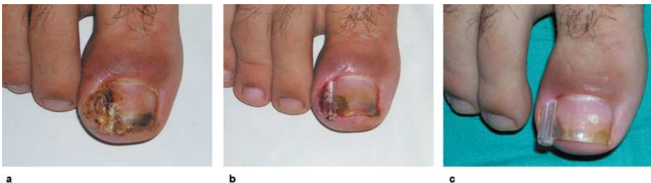
fig. 2 (a) An ingrown nail with severe granulation tissue. (b) Removing the granulation tissue and splinting. (c) Eleven days after treatment. There is neither pain nor erythema and exudation.