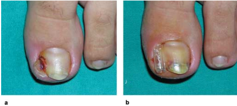
fig. 1 (a) Ingrown nail with granulation tissue. (b) Splinting the ingrown edge with the plastic tube after removing the excessive tissue.